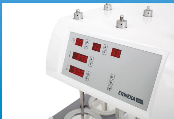
LED-display and symbol keypad for easy control