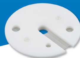
Low-evaporation vessel covers are included

Dimensions (width / depth/ height): 510 mm / 450 mm / 660 mm / 30 kg (weight)