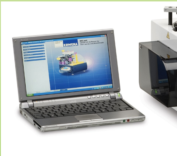
MC.net software for operation of the TBH 425.