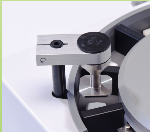
Optional thickness testing up to 10 mm samples.