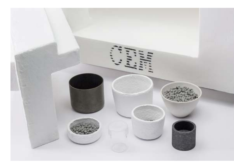
Use any crucible that may be used in a conventional muffle furnace including platinum.

For more control, the NIST-traceable dual thermocouple measures air temperature in the furnace center, allowing simultaneous, independent measurement of the furnace chamber temperature. The Calibration Source Instrument, also NIST-traceable, works with the Phoenix software to calibrate the temperature controller with the time and date recorded in the computer memory for display and/or printout.