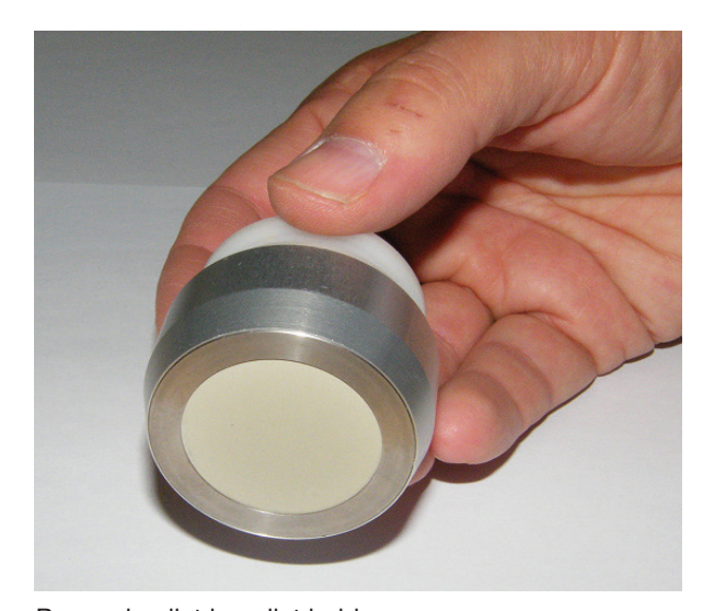
Pressed pellet in pellet holder