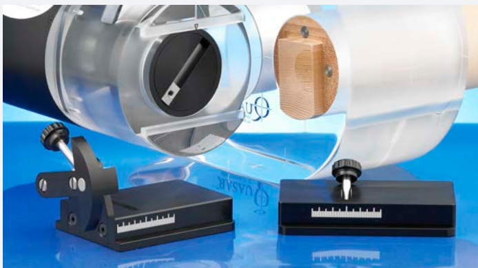
Above: Optional Rotation Stage accessory for adding 3D motion